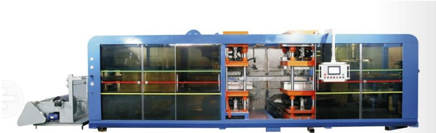
Unwinding unit 片材开卷装置