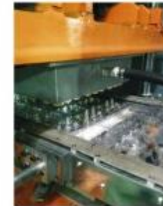
铝模 Forming mold