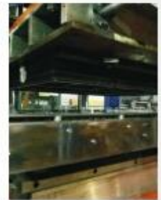
刀模 Cutting mold